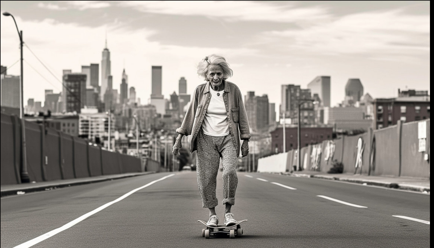
Midjourney's Generated Image #5