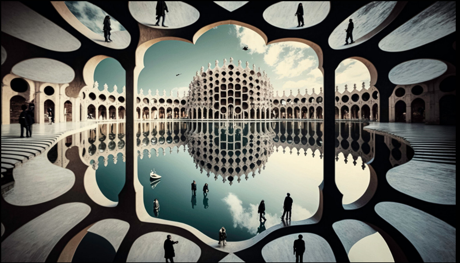
Midjourney's Generated Image #4