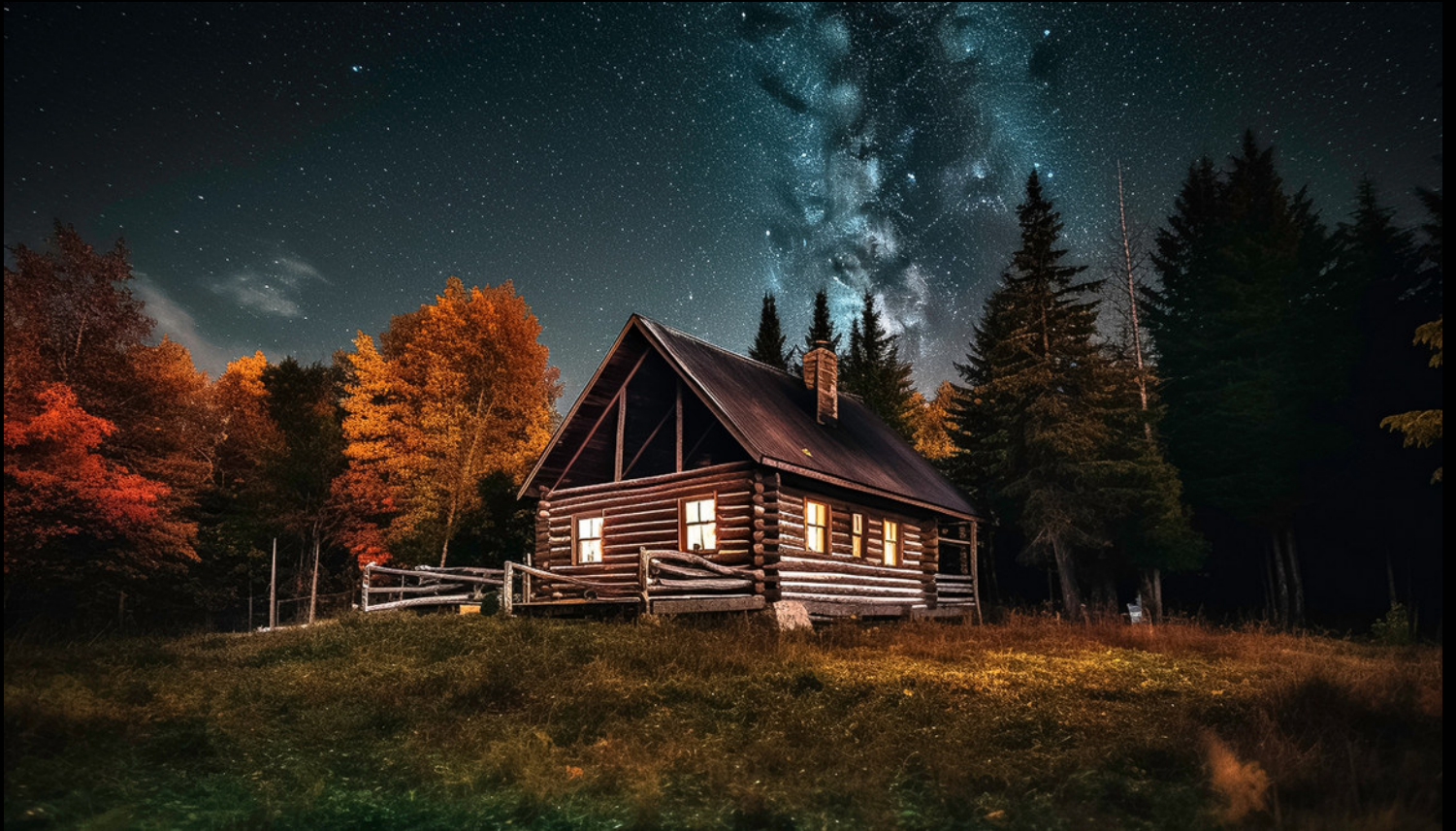
Midjourney's Generated Image #3