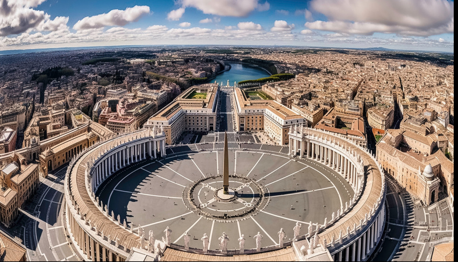
Midjourney's Generated Image #8