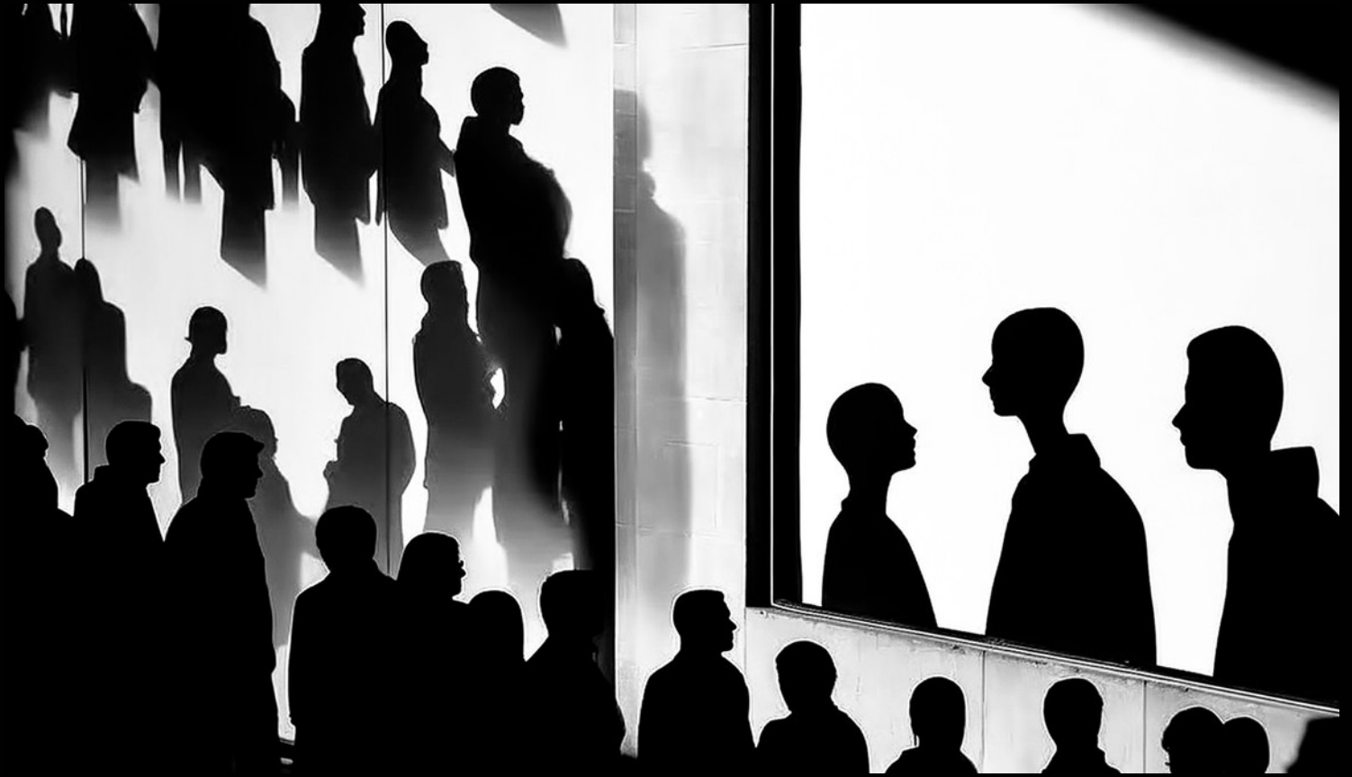
Midjourney's Generated Image #2