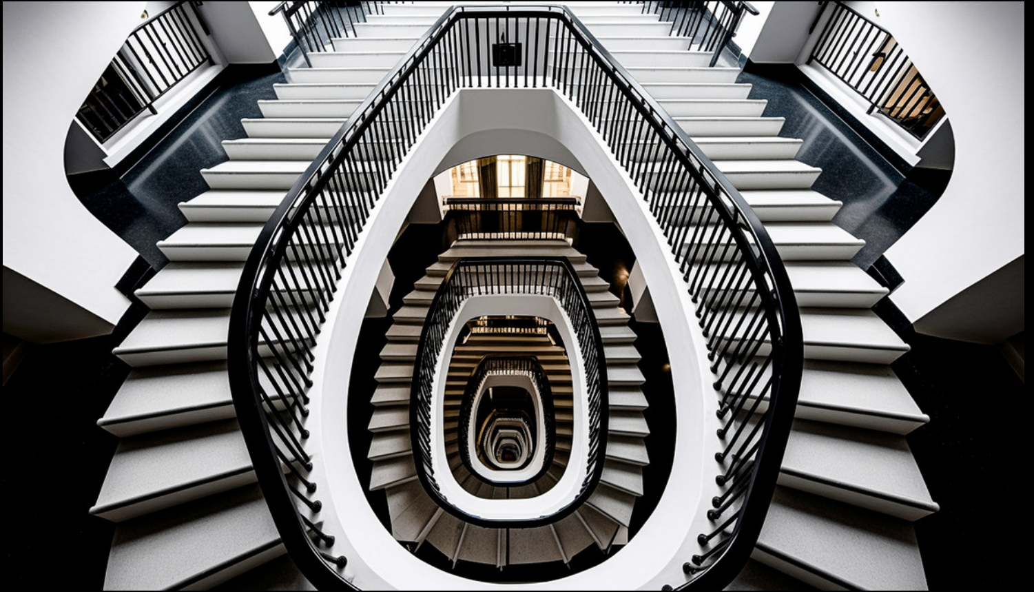
Midjourney's Generated Image #7