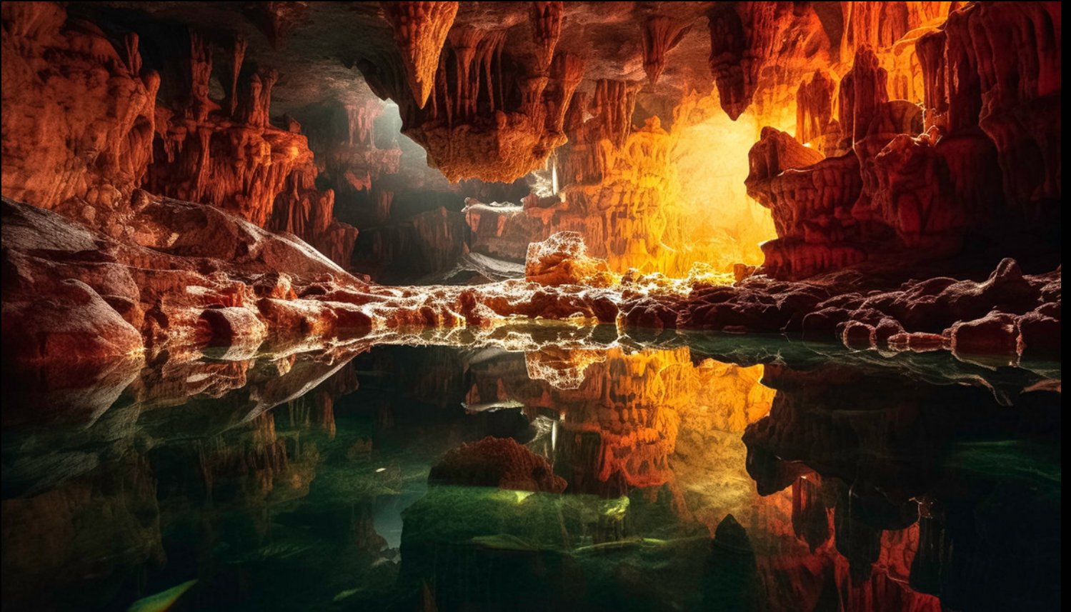
Midjourney's Generated Image #1