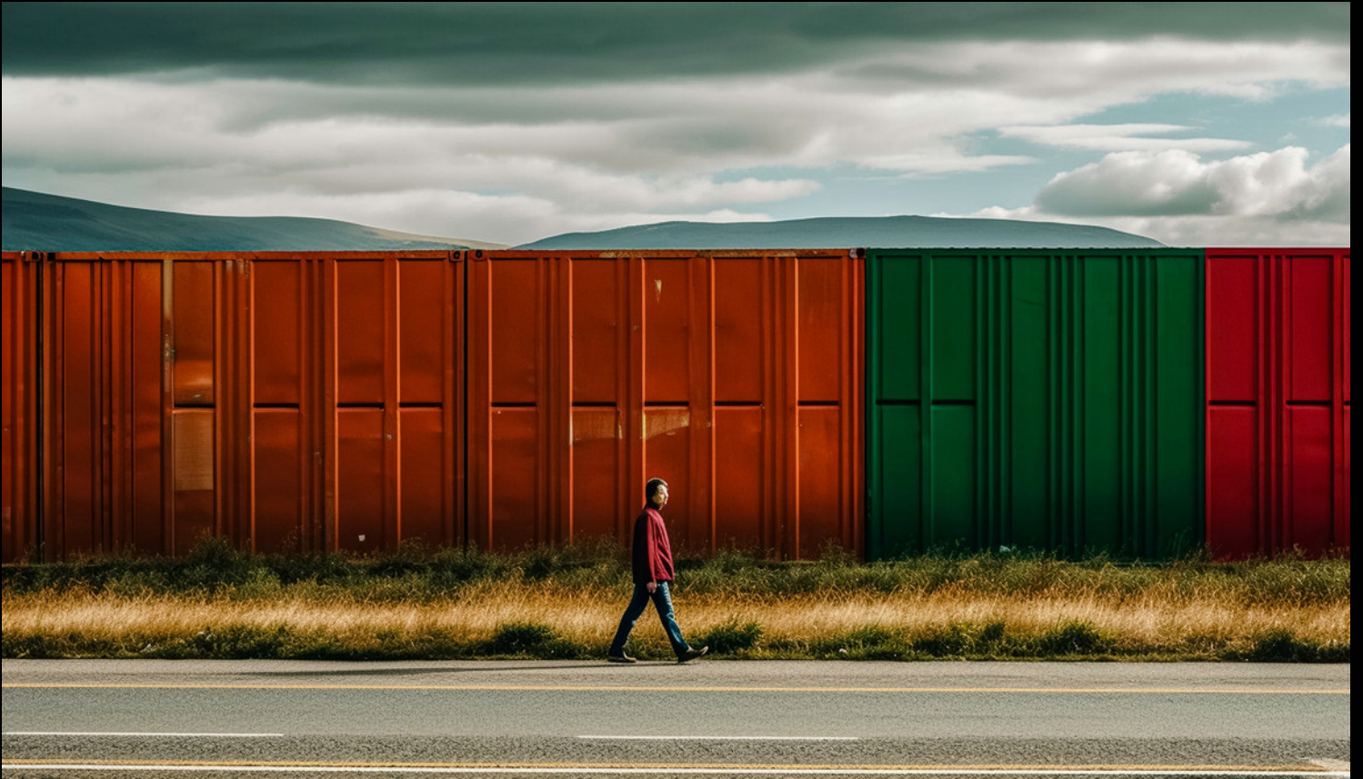
Midjourney's Generated Image #6