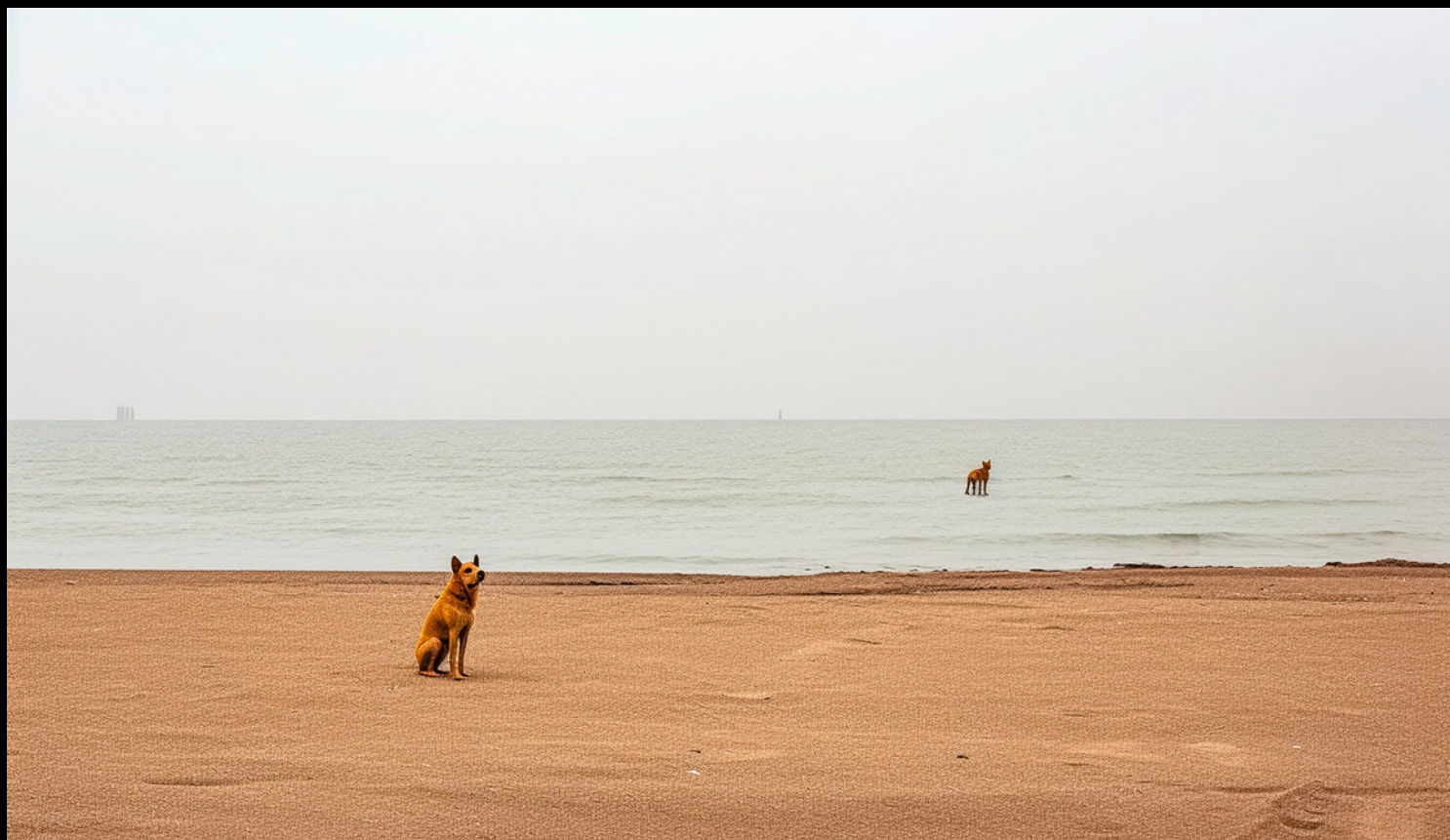
Midjourney's Generated Image #10