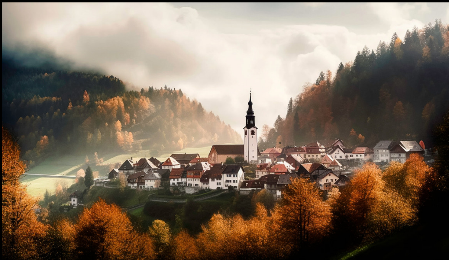
Midjourney's Generated Image #9